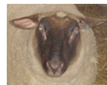
X No wool on head