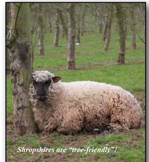
Shropshires are "tree-friendly"!