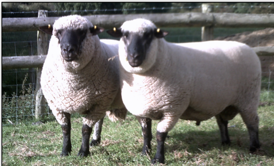
Westwood rams, Adam and Archer (right) - the breed champion at Three Counties Show 2011.