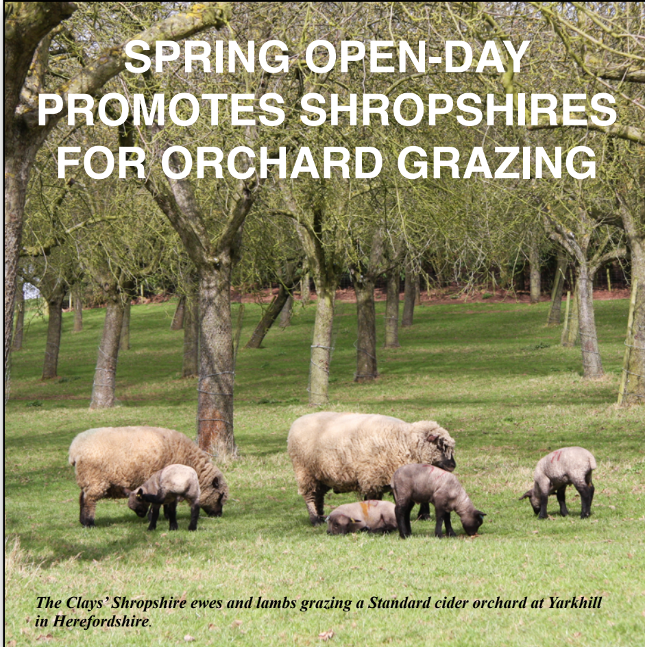
The Clays' Shropshire ewes and lambs grazing a Standard cider orchard at Yarkhill in Herefordshire.

THIRTY farmers and growers attended an open-day in Herefordshire on 20th March to find out more about grazing Shropshire sheep in cider orchards.