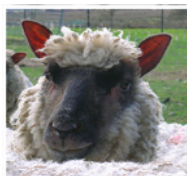
X Pricked Ears

Occasionally a black area devoid of wool may develop between the ears of rams and this should not extend any further back than the ears.