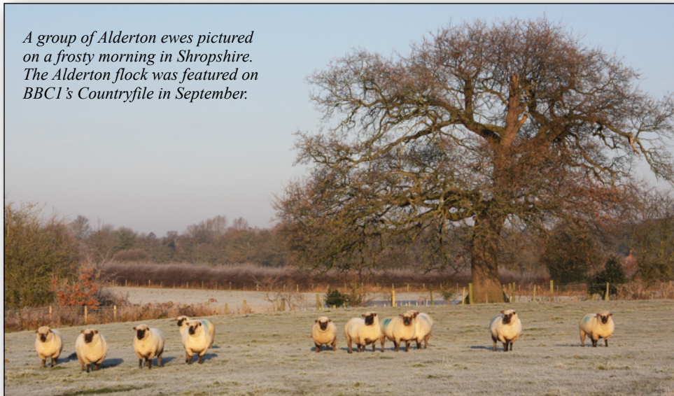
A group of Alderton ewes pictured on a frosty morning in Shropshire. The Alderton flock was featured on BBC1's Countryfile in September.

DIARY DATES FOR 2014 National Show and Sale (West) at Shrewsbury Livestock Market: Saturday 26th July National Show and Sale (East) at Melton Mowbray Livestock Market: Friday 12th and Saturday 13th September