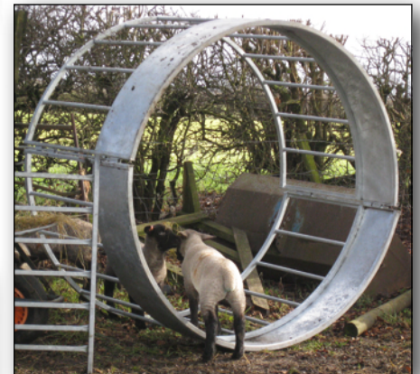
Two lambs from Trevor Lightfoot's Flock: "Is it true that Trevor's going to use us to generate his electricity?"