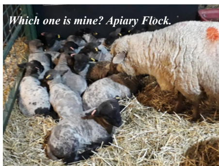
Which one is mine? Apiary Flock.