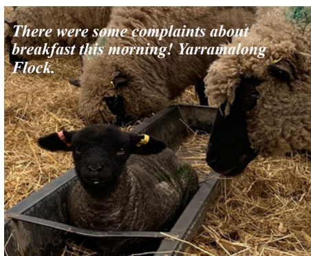
There were some complaints about breakfast this morning! Yarramatong Flock.