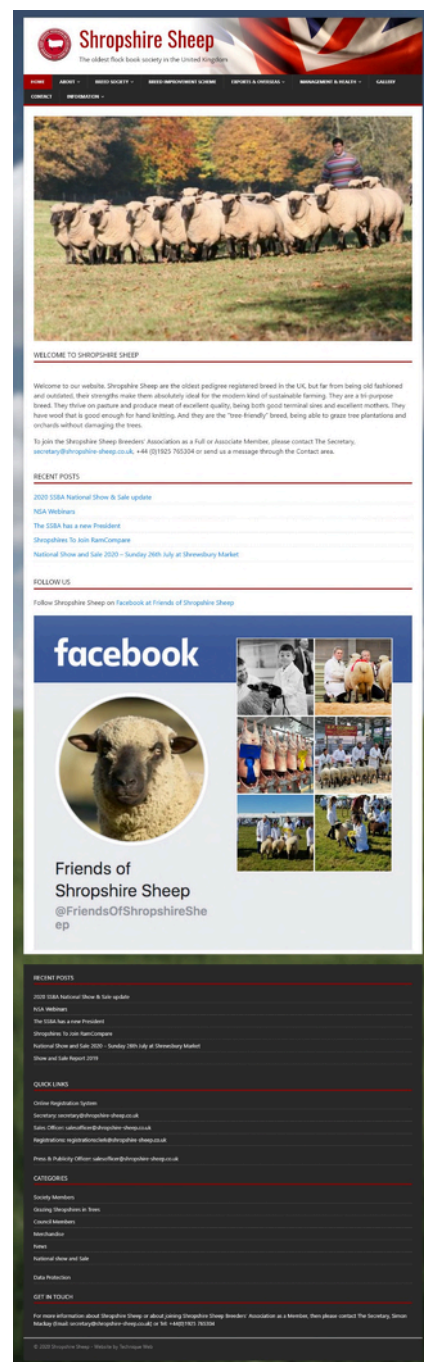
Above: a screen shot of how the new website homepage appears on smart phones - including welcome message, news and links to our Facebook page.