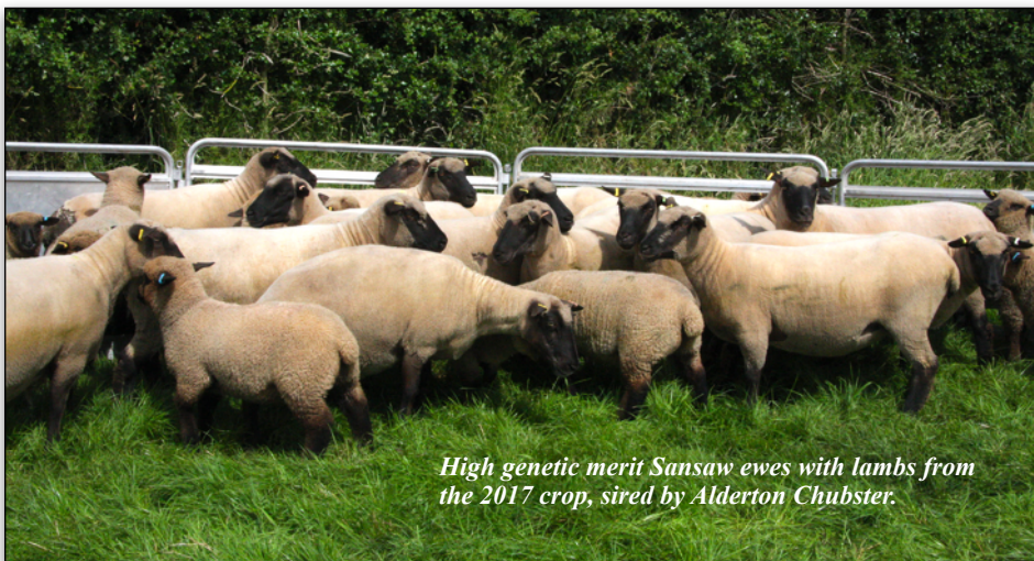
High genetic merit Sansaw ewes with lambs from the 2017 crop, sired by Alderton Chubster.

His Maternal Index score of 239 is still within the top 10% of the breed, although no longer top 5% because the breed average has moved up each year. His muscle depth EBV of 2.53 is also currently in the top 10% of the breed.