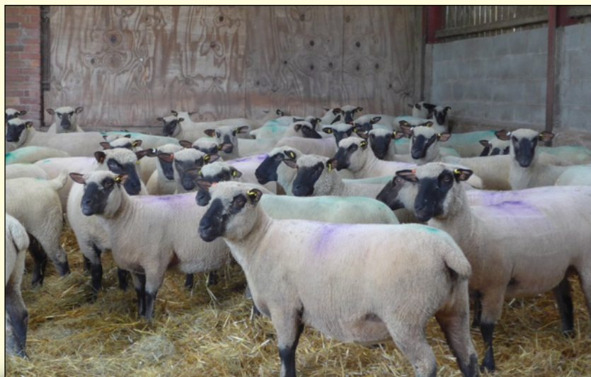
Shearling ewes pictured at the export assembly centre.